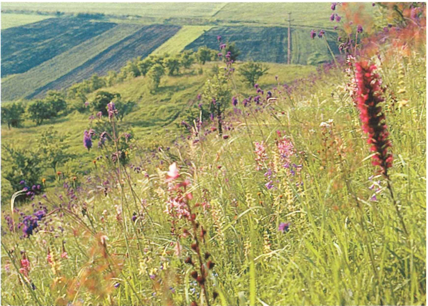
Fig. 3: Species-rich stand of the Stipetum pulcherrimae with Echium russicum , Salvia nutans , Dictamnus albus , Stachys recta , Verbascum phoeniceum , and Campanula sibirica near Mociu (Photo: Eszter Ruprecht, May 2001).