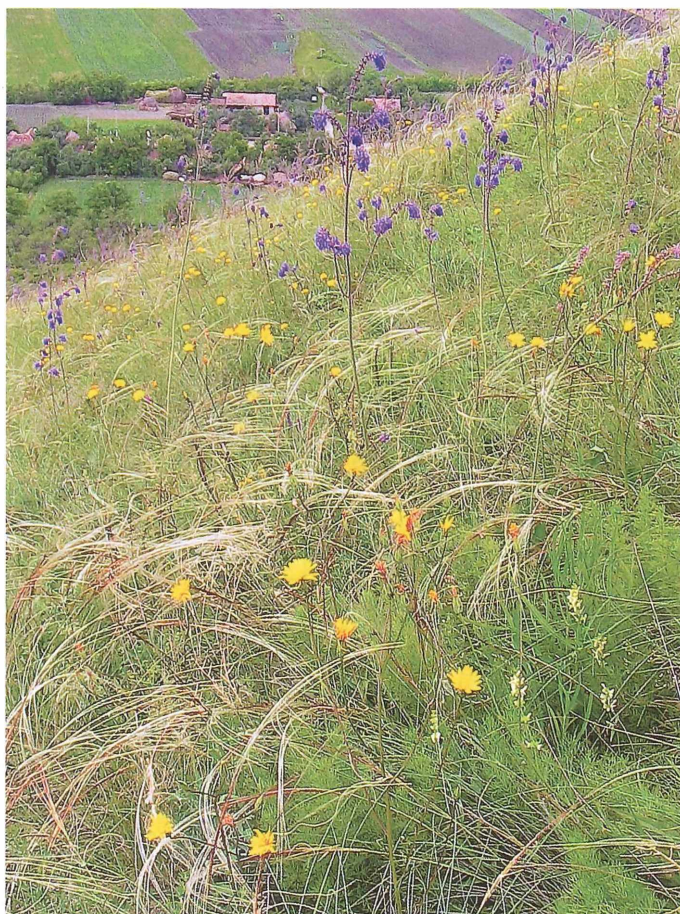
Fig. 4: Long-term abandoned stand of the Stipetum pulcherrimae with Salvia nutans , Leontodon crispus , and Adonis vernalis near Suatu (Photo: Mónika Deák, May 2003).