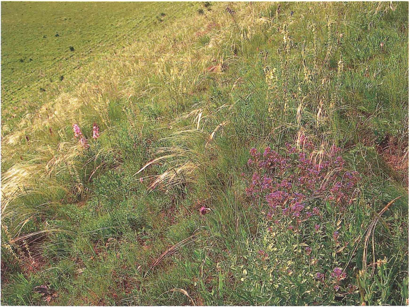
Fig. 2: Extensively grazed stand of the Stipetum lessingiana with Nepeta ucranica near Valea Florilor (Photo: András Kun, May 2003).