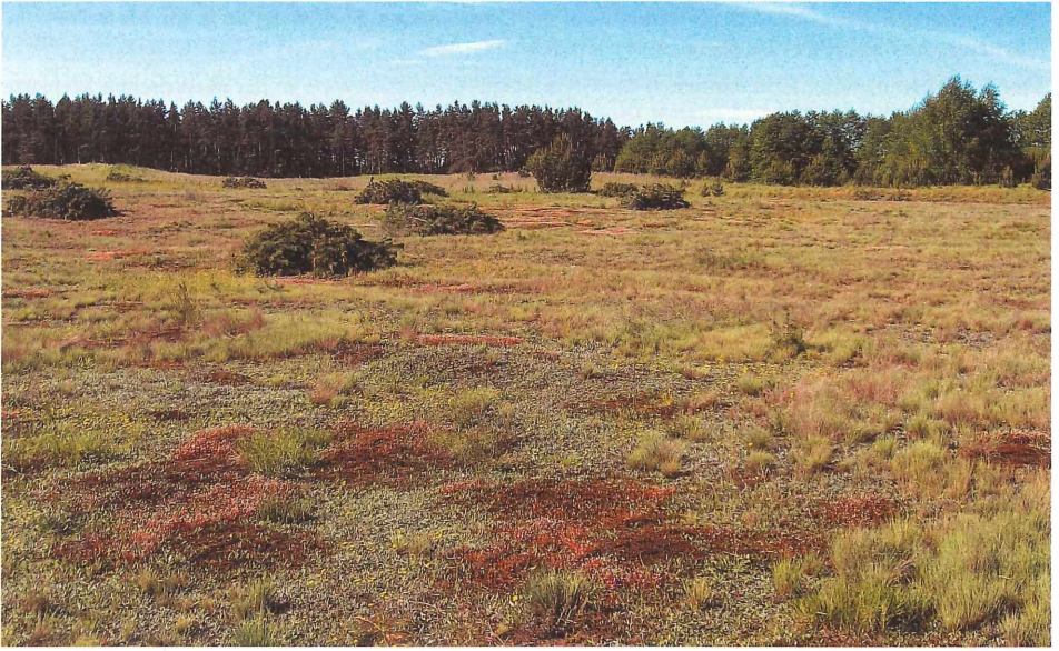
Fig. 4: Corniculario-Corynephorretum , subtype with Cladonia arbuscula ssp. mitis , variant with Polytrichum piliferum . Tree removal aimed at preserving open grassland phytocenoses in the village of Giedajty, Masurian Lake District (Photo: Barbara Juśkiewicz-Swaczyna, July 2008).

Abb. 4: Corniculario-Corynephorretum , Ausbildung mit Cladonia arbuscula ssp. mitis , Variante mit Polytrichum piliferum . Beseitigung von Bäumen als Maßnahme zur Erhaltung der offenen Sandtrockenrasen im Dorf Giedajty, Masurische Seenplatte (Foto: Barbara Juśkiewicz-Swaczyna, Juli 2008).