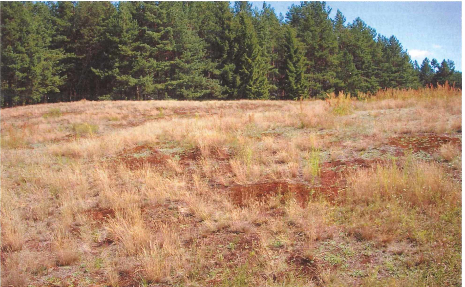
Fig. 5: Corniculario-Corynephorretum , subtype with Cladonia arbuscula ssp. mitis , variant with Polytrichum piliferum . Well-preserved dry grassland in the village of Wymój, Masurian Lake District (Photo: Barbara Juśkiewicz-Swaczyna, July 2008).

Abb. 4: Corniculario-Corynephorretum , Ausbildung mit Cladonia arbuscula ssp. mitis , Variante mit Polytrichum piliferum . Beseitigung von Bäumen als Maßnahme zur Erhaltung der offenen Sandtrockenrasen im Dorf Giedajty, Masurische Seenplatte (Foto: Barbara Juśkiewicz-Swaczyna, Juli 2008).