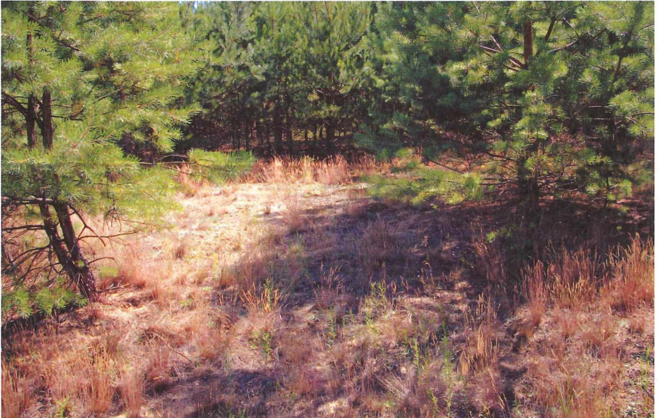
Fig. 3: Corniculario-Corynephorretum , typical subtype. Dry grassland overgrown with self-sown Pinus sylvestris – an example of natural succession – near the village of Wymój – Masurian Lake District (Photo: Barbara Juśkiewicz-Swaczyna, July 2008).