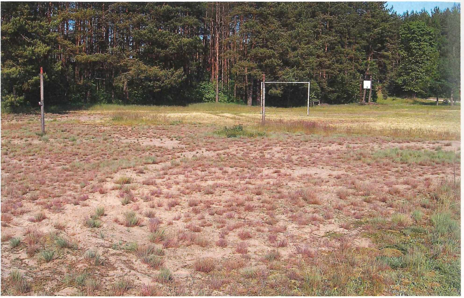
Fig. 2: Corniculario-Corynephorretum , typical subtype. Dry grassland seasonally used as a sports field in the village of Wymój, Masurian Lake District (Photo: Barbara Juśkiewicz-Swaczyna, July 2008).