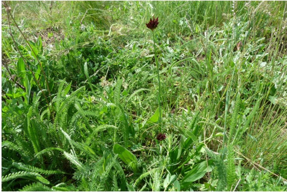
Fig. 2. Vegetation of a 4 m × 4 m establishment gap in the second year after sowing, with a high cover of sown species, such as Achillea collina , Dianthus pontederiae and Galium verum (Photo: S. Radócz, 25 May 2015).