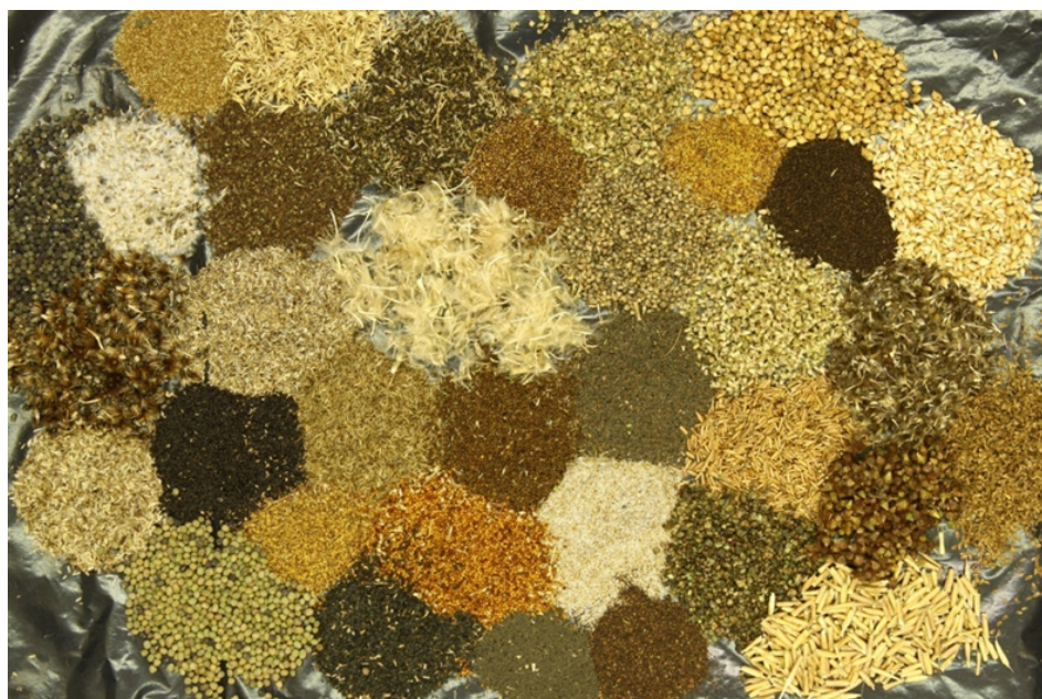
Fig. 1. The high-diversity seed mixture containing the seeds of 35 species typical of alkali and loess grasslands (Photo: T. Miglécz, 01 October 2013).

We selected eight sites restored by low-diversity seed sowing in 2005. At four sites we sowed an alkali seed mixture, at the other four sites a loess seed mixture. At every site gaps were established in October 2013. Soil preparation included digging over, rotary hoeing and raking to remove all rooting